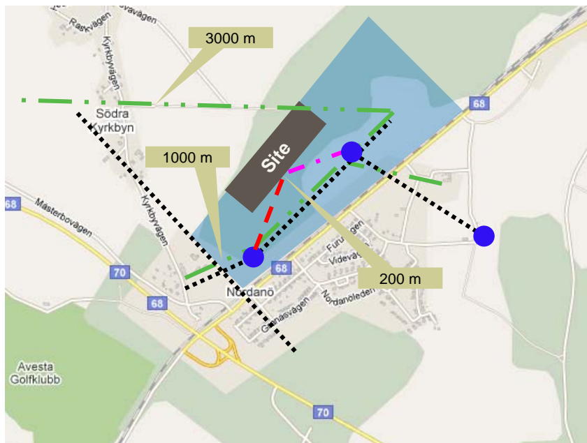
Fiber + Power alternative I, 2-20 MW