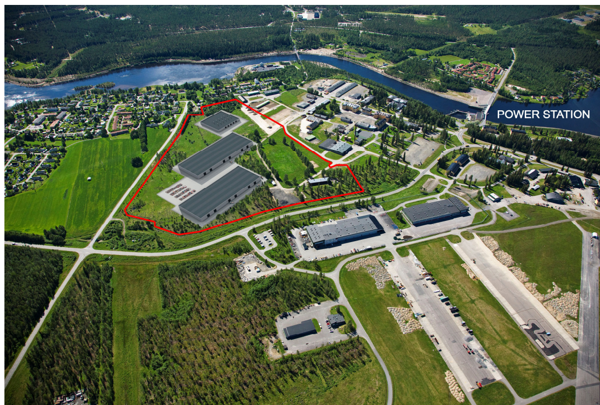
Image is a photomontage